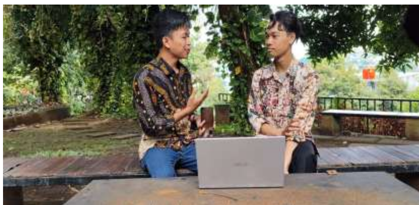
Image 2.2 Generation Z interview on Taswuf ethics

When talking about environmental issues, Generation Z shows a variety of views and attitudes. Some see it as an urgent challenge to overcome, while others may feel somewhat overwhelmed by its complexity. Overall, however, there is a tendency to recognize the importance of environmental protection for a sustainable future. Many of them observed a positive change in environmental awareness among their peers, especially in terms of increased use of eco-friendly goods and participation in nature conservation activities.