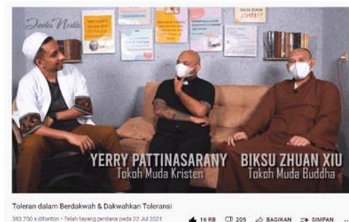
Figure 2. Display in content

who says it. Humans are told to use reason and mind, so they must also get rid of disputes and fights just because of different opinions (Hamka, 2020). Then Habib Husein asked the monk Zhuan Xiu about the problems faced by Buddhism as a minority in Indonesia. The monk Zhuan Xiu replied that so far, according to him, there is still discrimination against the Buddha, for example in the construction of places of worship. Even though all matters related to the construction of the place were taken seriously, he himself did not understand what the problem was. In Buddhism, the da'wah they do is not to invite others to enter Buddhism, but to spread kindness to others. Patience and sincerity are virtues that must be instilled in every individual.